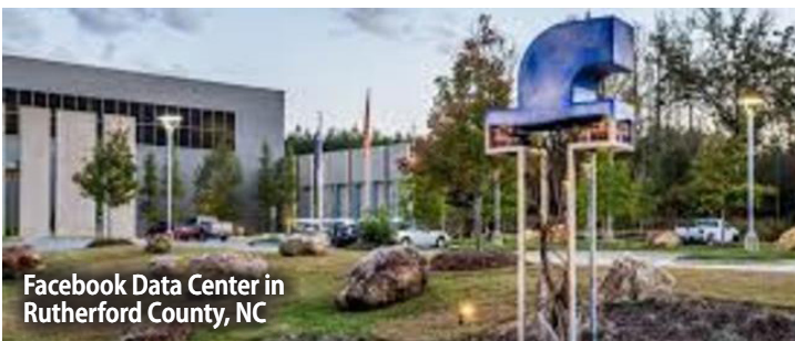
Facebook Data Center in Rutherford County, NC

RUTHERFORD BUSINESS CENTER 500 West Street Rutherfordton, NC 28139 www.rutherfordbusiness.com