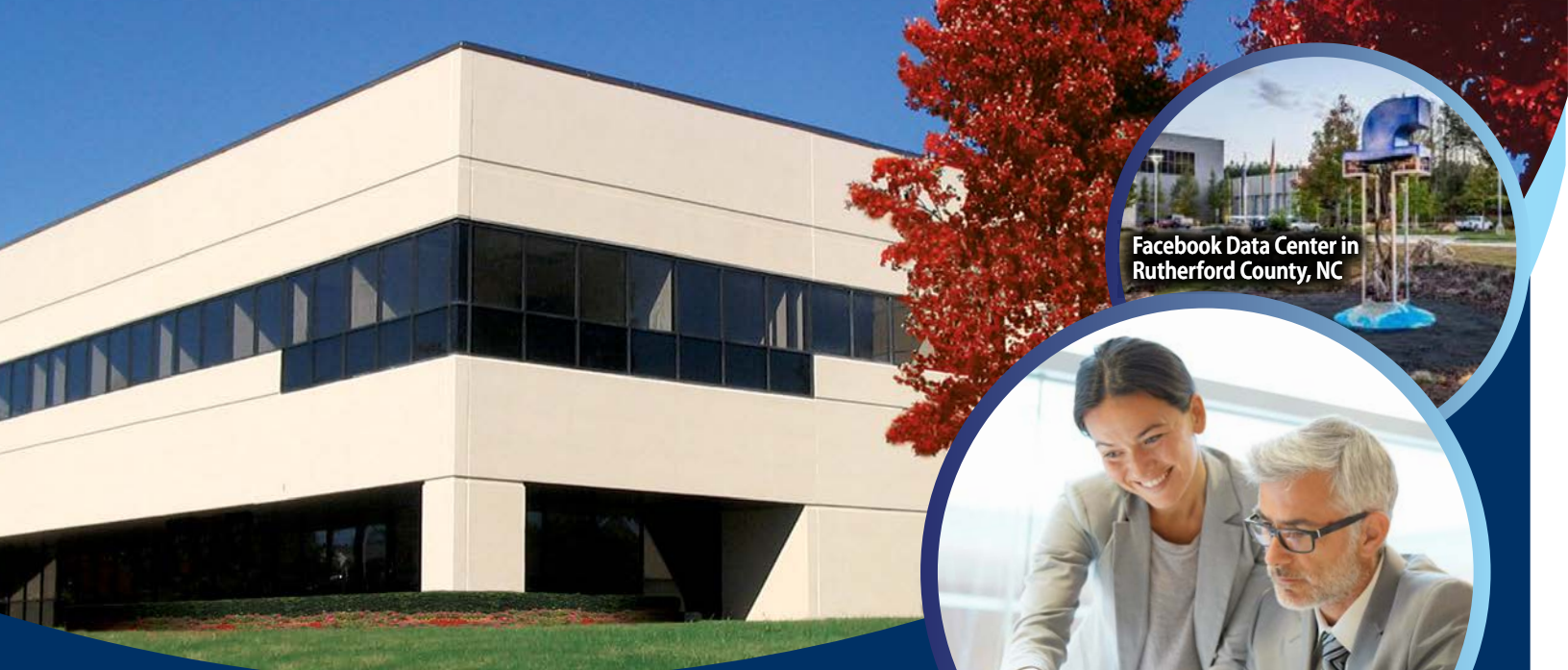
Facebook Data Center in Rutherford County, NC